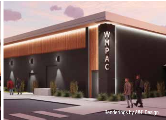
Renderings by A&E Design