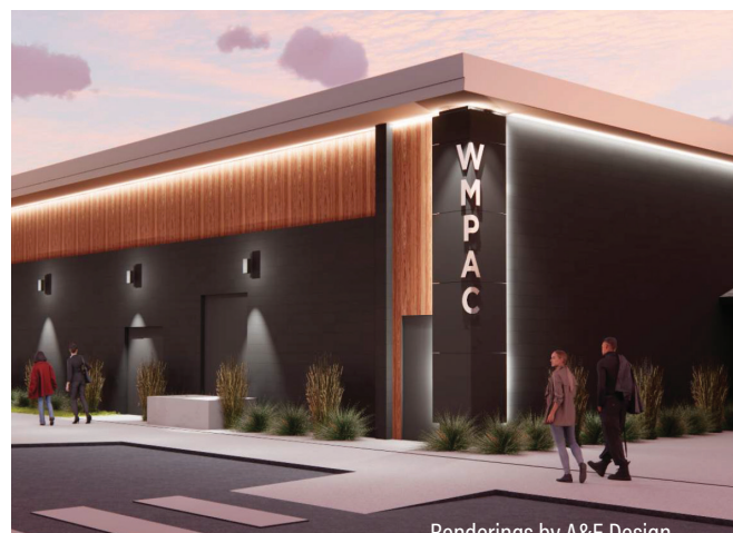
Renderings by A&E Design